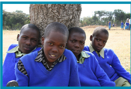
Some of the Salabwek children who benefit from the rain catchment system.

and is connected to a pump that sanitizes the water. The community can access the water through two water taps located on the side of the tank.