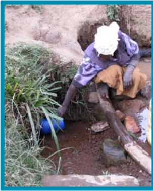
Before the water system women would collect water from the Mara river.

Originally the community of Salabwek did not have a water or sanitation system in place. Women and children would have to walk up to three hours to collect water from local streams or the Mara river. As a result of the time involved in this task children would be unable to attend school.