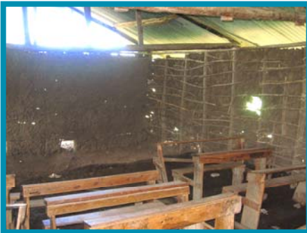
The old Salabwek school

Salabwek’s local school was built in a small three-acres area, which was divided into two compounds. The walls were made of sticks, mud and cow dung.