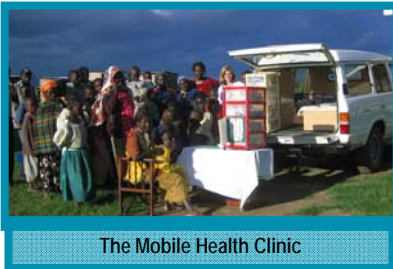
The Mobile Health Clinic

Free The Children has undertaken several initiatives to improve the health of Salabwek’s community members. From a mobile health clinic to health workshops, Free The Children provides a wide range of treatment and preventive measures. Free The Children nursing staff are well trained and committed professionals able to modify the materials, the number of workshops and the interaction with the each group based on the group’s knowledge base, the need, the interest and how easily the information is absorbed and put into action in order to ensure