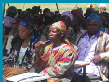
The Women's Leadership Conference

The success of our alternative income programming can also be witnessed in the initiatives that have resulted (directly or indirectly) from such efforts.