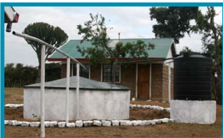
The new Salabwek rain catchment system

Thanks to SVQF's contribution the community now has a rain catchment system designed to provide clean and safe water in the community. This very successful project was built in connection with the school as it is a centralized location that allows all community members to equally access the water. Each class room is outfitted with tin roofs that collect the water, which comes down through a pipe to a reservoir tank. The tank can hold 2300 litres of water