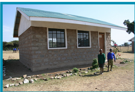
The new Salabwek school

Thanks to the generous contribution of SVQF, Salabwek now counts with eight fully functional classrooms. Each classroom is made of solid concrete and has five big windows that bring in light, warmth and proper air circulation to the room. The classrooms are designed and outfitted with new desks to sit 40 students and a teacher. The roof of every classroom is made of tin and designed to collect the rain as part of the local water system (see Water and Sanitation section).